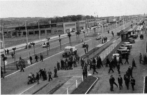
Fig. 20. Rush hour congestion is a problem for large industrial estates; the beginning of the surge home at Team Valley Estate, County Durham.